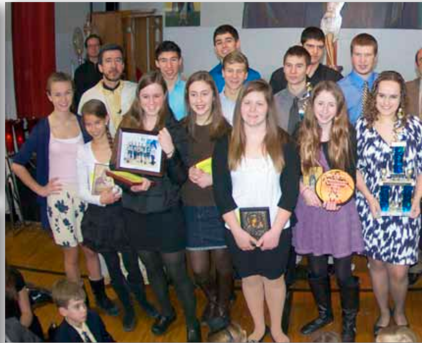
March 2012: Holy Trinity GOYA celebrates an active month. Above: Follow with community with their collection of this season's volleyball and basketball trophies. Also, their monthly fellowship meeting.