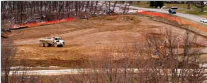
Left: The main area where the Community Center is to be located is dug out and flattened. Because of the size of our property, we have been able to save on fill through some very astute decisions by our construction supervisors, who have used dirt from areas being dug out to fill spaces in other areas of the project. The pipes to the left are being embedded beneath the main entrance to the property.