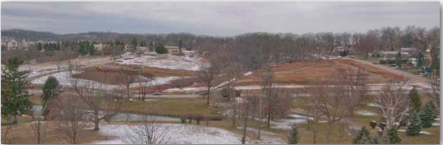
Above: Despite a few days of snow, including the one pictured above, this project has been blessed with unseasonably warm and favorable weather. The long view above shows the progress as of early March.