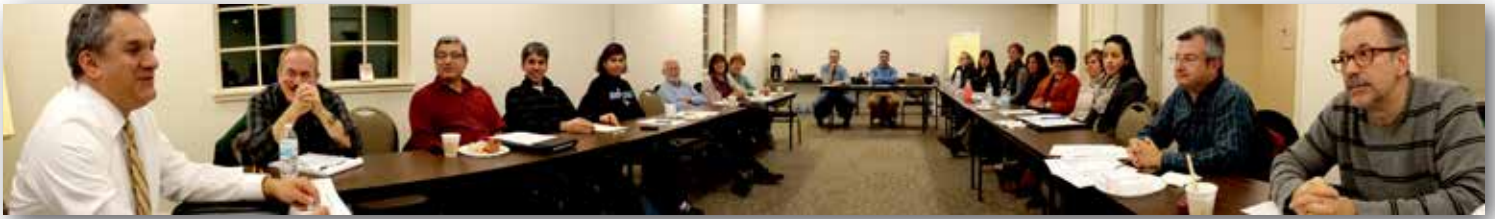
November 12, 2013: Holy Trinity Church's "Council of Ministries" holds its first meeting in the new church facility. Pictured here are leaders of the many ministries of the parish, working to coordinate and grow the ministry offerings and to involve everyone in the life of the Church.