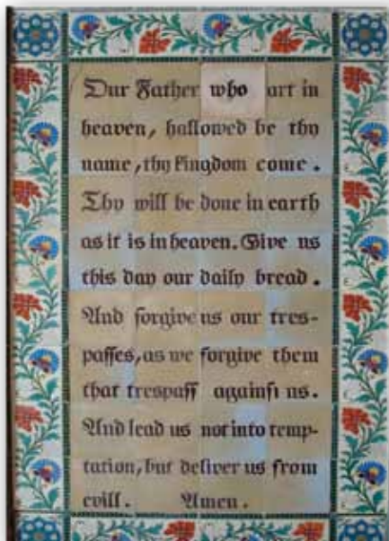
The Lord's Prayer Mosaic in English from the Church of "Pater Noster" in Jerusalem