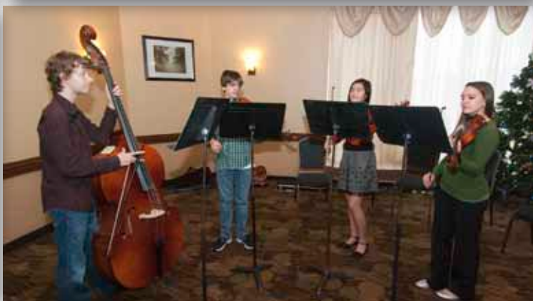
December 4, 2012: Approximately sixty seniors of the Holy Trinity community gathered for their annual Christmas Luncheon in preparation for the Birth of Christ. This year's luncheon was held at the Holiday Inn on McKnight Road. The group was entertained by a string quartet of very talented students from North Hills High School, who played a variety of beautiful Christmas music.