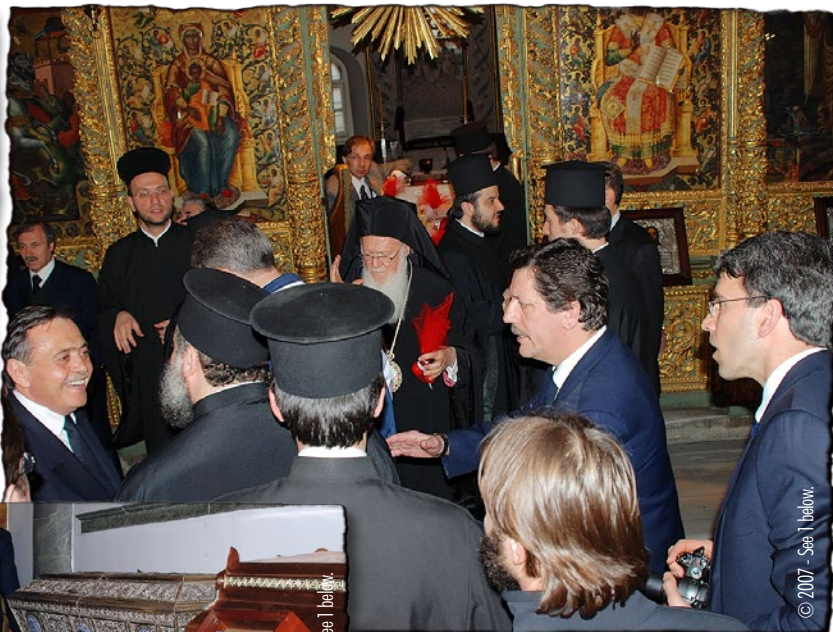
April 11: (Above) His All-Holiness Patriarch Bartholomew distributing Paschal eggs. (Left) Members of the pilgrimage venerate some of the relics enshrined at the Patriarchal Cathedral of Saint George, including those of Ss. John Chrysostom & Gregory the Theologian.