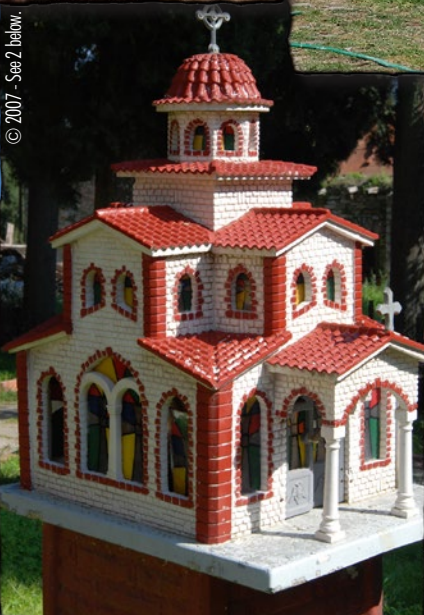
April 14: (Above) The massive bells removed from the bell tower during the renovation of St. Andrew Monastery (1849 A.D.). They were a gift to the monastery from the Tzar of Russia. The monastery had been closed from 1972 to 1992, when the last of the Russian monks fell asleep in the Lord. Now, along with many of the other monasteries, it is being renovated and restored, and many new faithful men are seeking to enter the monastic life there. (Far Left and Left) Can you spot the real church? On the left, two of our pilgrims marvel in awe at the magnitude of the Saint Andrew Monastery, one of the largest on Mount Athos, also known as "Serai," which means palace in Arabic. At the right is simply a proskinitarion (place of veneration) built in the style of a church. It is located in the courtyard of Serai and is only the size of a large birdhouse!