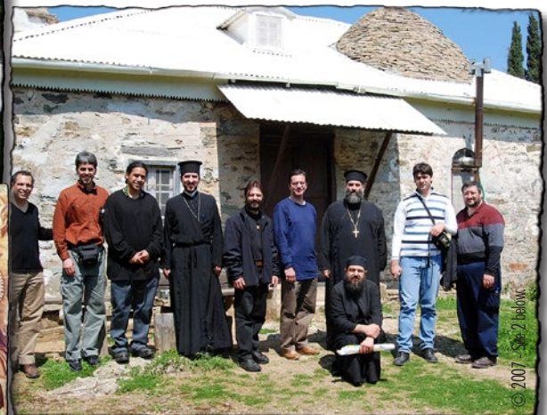
April 15: (Far Left) On the path to Iviron Monastery (976 A.D.), the home of the very famous Portaitissa (Keeper of the Portal) icon of the Theotokos, which miraculously bled from the cheek when stabbed by an invading pirate. (Above) The pilgrims at the cell of Elder Paisios, one of the most influential contemporary Athonite elders, now reposed. The icon of the Panaghia on the left was his favorite icon of her for an amazing reason: he had been given a vision from God of an appearance of the Theotokos, and this icon was the one he said most resembled her actual face! (Bottom Left and Center) The domes and complex bell tower machinery of the Great Lavra Monastery (963 A.D.), where the pilgrims spend night two on Athos.