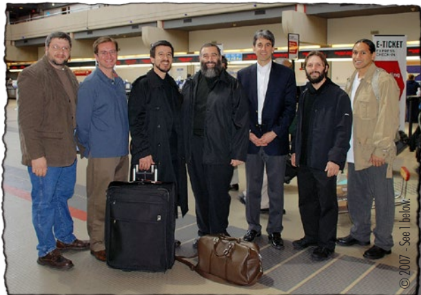
April 10: The team of pilgrims arrive at Pittsburgh International Airport and prepare to check-in for their 24-hour journey to the Patriarchate.

From April 10-21, 2007, a team of clergy and laymen from the Greek Orthodox Churches of Holy Trinity (Pittsburgh), All Saints (Canonsburg) and Holy Cross (Pittsburgh) gathered in the Holy Spirit for a holy pilgrimage to some of the most historic and important destinations in Orthodox Christianity: Constantinople (now known as in modern Turkey), Thessaloniki (second city of honor and rank in the Byzantine Empire) and Mount Athos (the center of Orthodox monasticism located in Greece, populated by dozens of ancient monasteries). The following pictures provided a glimpse into this holy journey, made by eight men in person, but spiritually accompanied by and carrying the prayers for the many members of their respective parishes, families and friends. The explanations of the photos are brief to preserve space; watch for announcements about live presentations to hear more detailed information on the places visited and experiences encountered.