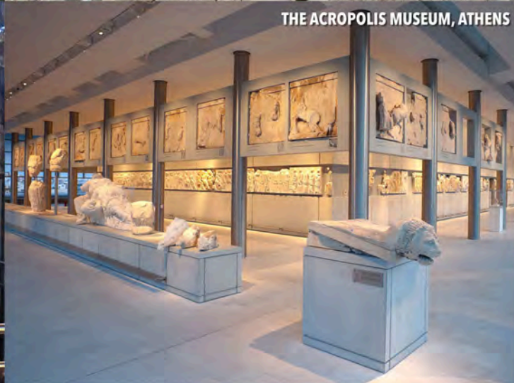
THE ACROPOLIS MUSEUM, ATHENS