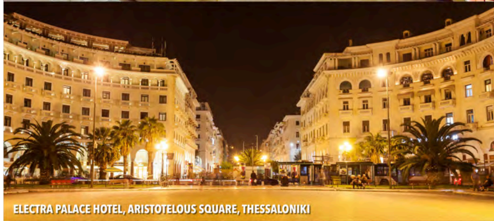
ELECTRA PALACE HOTEL, ARISTOTELOUS SQUARE, THESSALONIKI