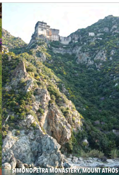
SIMONOPETRA MONASTERY, MOUNT ATHOS