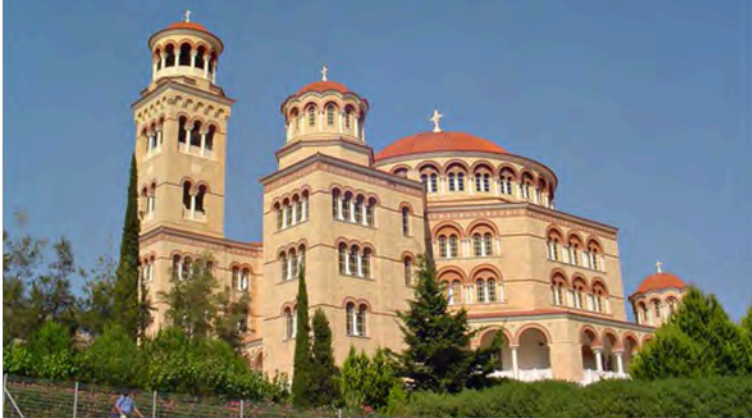
SAINT NEKTARIOS MONASTERY AND CHURCH, AEGINA