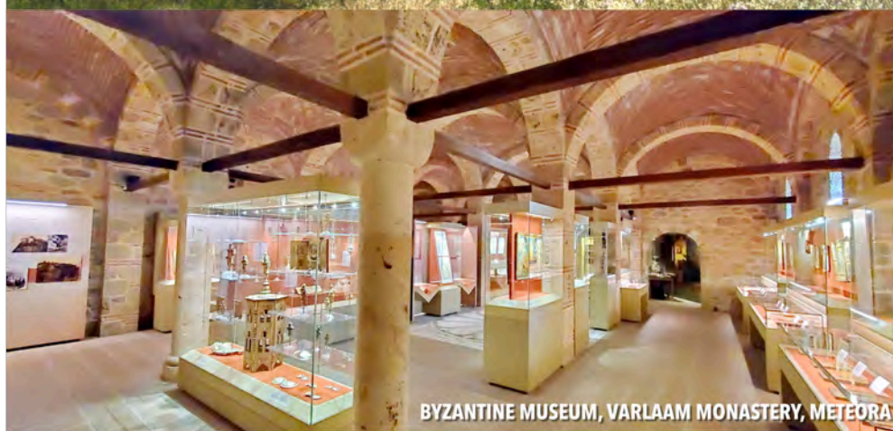
BYZANTINE MUSEUM, VARLAAM MONASTERY, METEORA