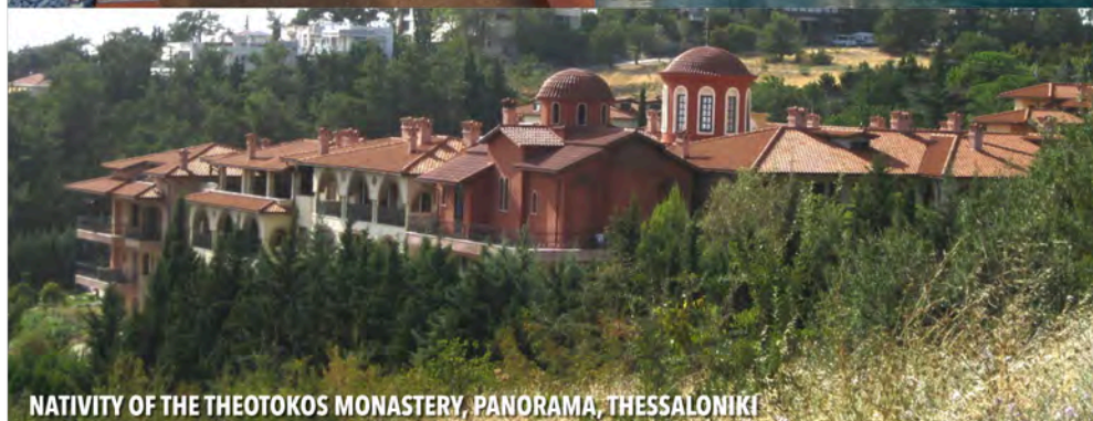
NATIVITY OF THE THEOTOKOS MONASTERY, PANORAMA, THESSALONIKI