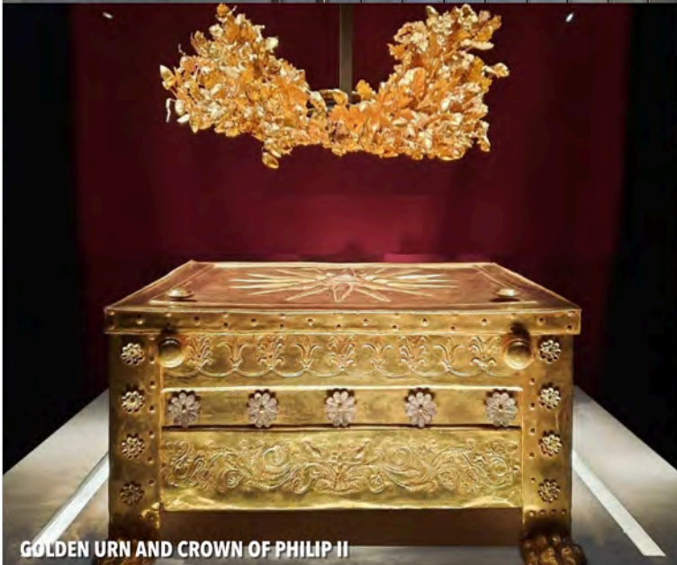
GOLDEN URN AND CROWN OF PHILIP II