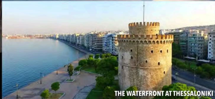
THE WATERFRONT AT THESSALONIKI