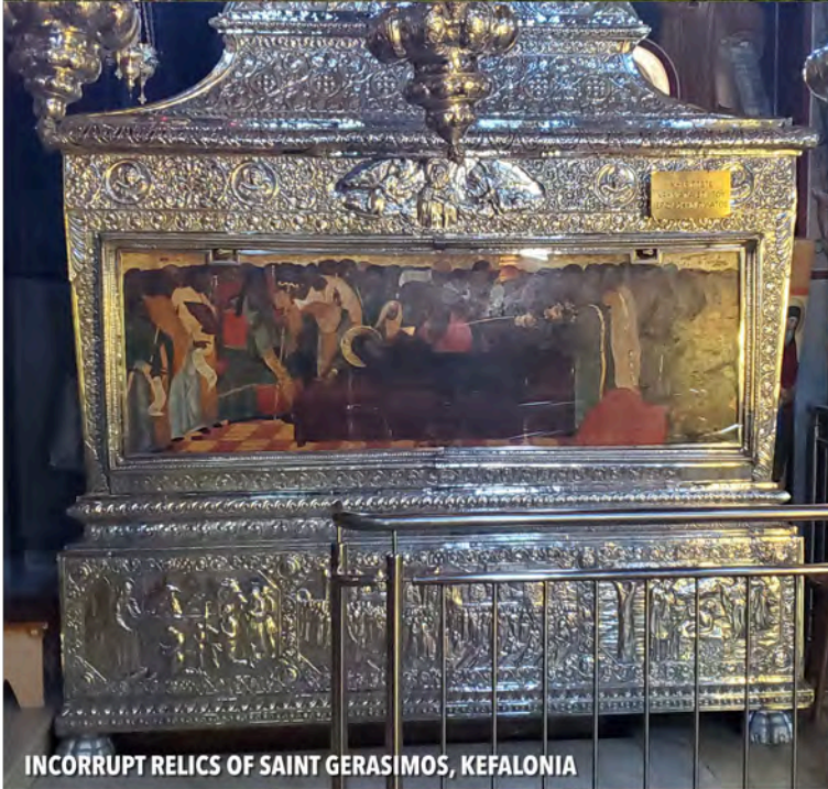
INCORRUPT RELICS OF SAINT GERASIMOS, KEFALONIA